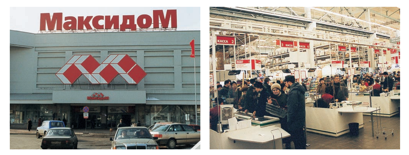
Now that Russians can own their homes, they're spending fast in home improvement stores like this one in St. Petersburg. In English it would be called "Super Home."